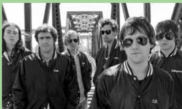
Conor Oberst and The Mystic Valley Band

July 4 at 3:30: Rolling Stone magazine's top songwriter of 2008, Conor Oberst, brings his Mystic Valley Band to New York to headline an Independence Day celebration with a concert in Battery Park. Jenny Lewis, lead singer for Rilo Kiley, kicks off the festivities. This event is not ticketed, but space is limited and will be available on a first-come, first-served basis.