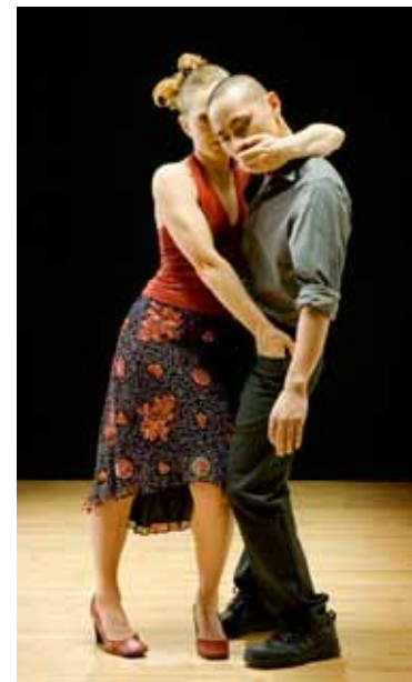
Zvi Dance: Photo © Klaus Schoenwiese

And those are just a few. Check out RiverToRiverNYC.com for the complete updated summer schedule.