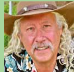
Arlo Guthrie: Photo © Michelle McDonald

Free tickets will be distributed two per person outside Castle Clinton on a first-come, first-served basis starting at 5:00pm on the day of the show.