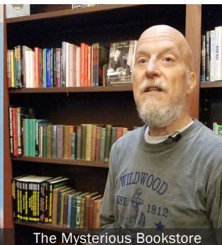
The Mysterious Bookstore