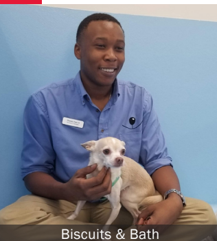
Biscuits & Bath