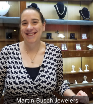
Martin Busch Jewelers