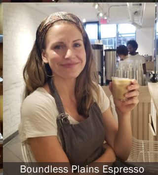
Boundless Plains Espresso